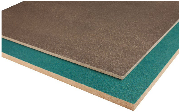
Tuulileijona, Runkoleijona Wind Barrier Boards (impregnated softboard SB.H)