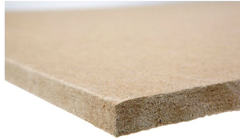
Huokoleijona - Insulation Board (insulating board WF)