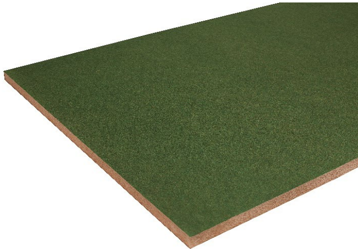
ISOplaat - Wind Barrier Board (impregnated softboard SB.H)