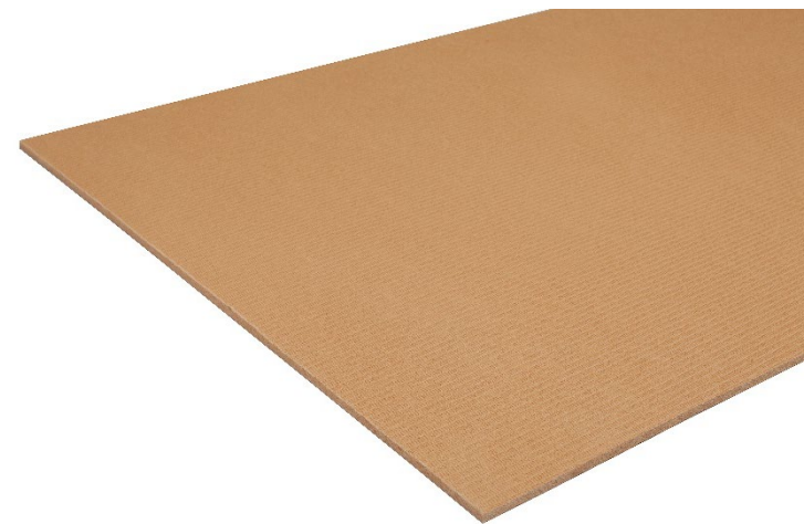
ISOplaat - Insulation Board (insulating board WF)